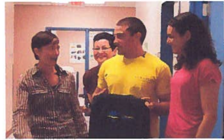
Education and awareness at community events, Open house, Alive to Strive and WorldriderZ