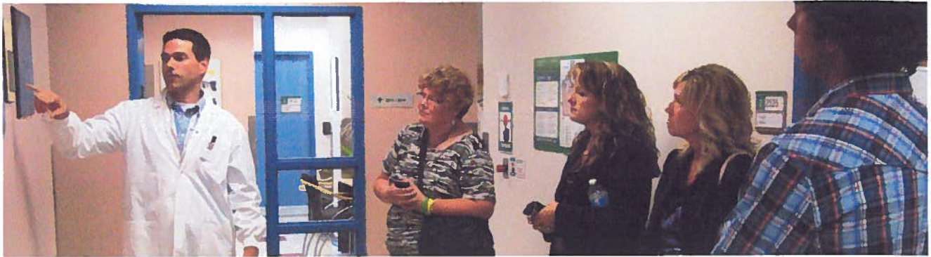
Open House May 24th